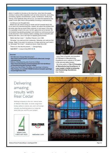
1/2 Page Horizontal 9.35" x 6.4"