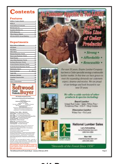
3/4 Page 7" x 13.25"