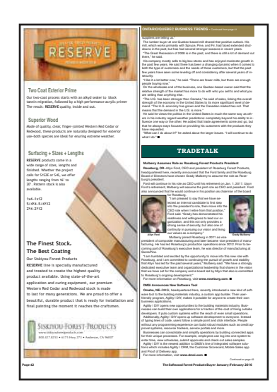
1/2 Vertical 4.5" x 13.25"