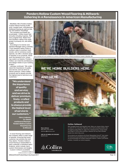
1/2 Page Island 7" x 9"