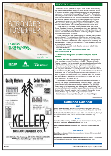
1/4 Page 4.65" x 6.3"