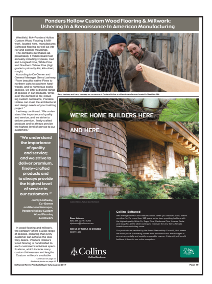
1/2 Page Island 7" x 9"