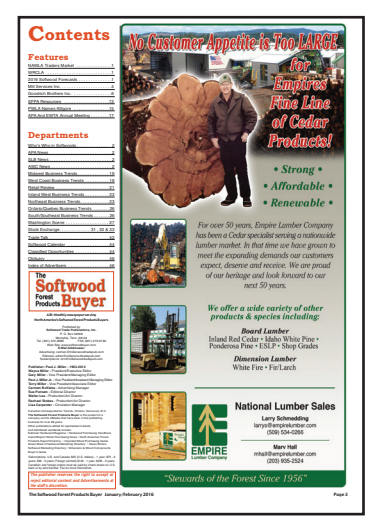
3/4 Page 7" x 13.25"

NOW AVAILABLE: Center Spread (with Bleed) 20.75" wide x 14.75 deep; Finished Trim 20.5 x 14.5; Live area 19.5" x 13.5". Please keep photos and text in the Live area.