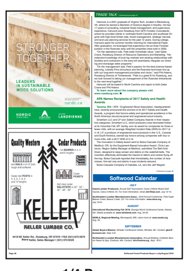
1/4 Page 4.65" x 6.3"