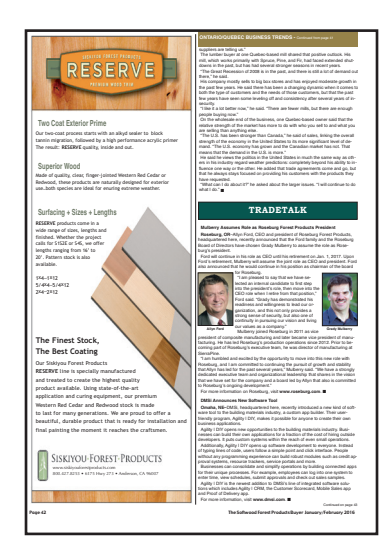
1/2 Vertical 4.5" x 13.25"